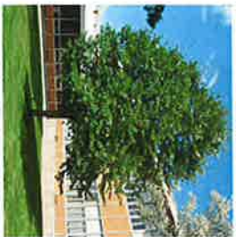
Cherry, Black ( Prunus serotina )

Mature Height: 6-12 feet Growth Rate: fast Growth Habit: upright to rounded, multi-stemmed Cold Hardiness: good Drought Resistance: good Fruit: small edible nut Fall Color: copper-red Pests: leaf spot, caterpillars, blight Other: suckers