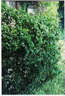
Hazelnut, American ( Ytilia americana )

Mature Height: 6-12 feet Growth Rate: fast Growth Habit: upright to rounded, multi-stemmed Cold Hardiness: good Drought Resistance: good Fruit: small edible nut Fall Color: copper-red Pests: leaf spot, caterpillars, blight Other: suckers